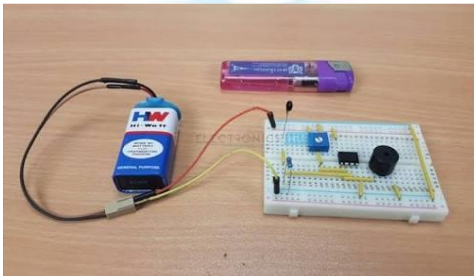
Fig. 6 Circuit Layout

The generated frequency produces sound when it is connected to the loud speaker. In the above circuit the sensor uses germanium diode DR25 which is reverse biased in the circuit. The reverse resistance of the diode is very high and current cannot pass through the diode at room temperature. In the astable multi vibrator of our circuit, the reset in 8s connect ground. At this condition the astable multi vibrator cannot produce frequency.