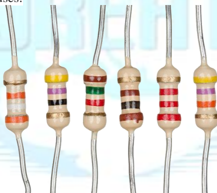
Fig. 1 Resistors

A resistor is a passive two-terminal electrical component that implements electrical resistance as a circuit element. In electronic circuits, resistors are used to reduce current flow, adjust signal levels, to divide voltages, bias active elements, and terminate transmission lines, among other uses.